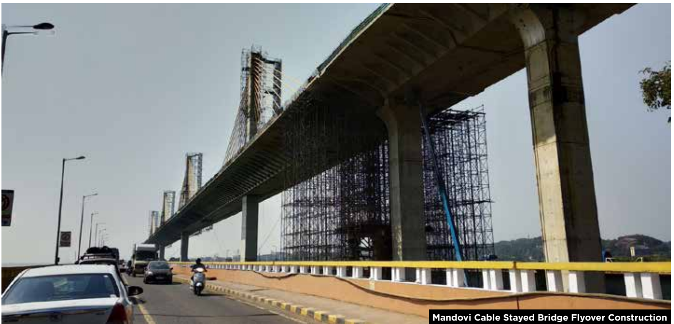
Mandovi Cable Stayed Bridge Flyover Construction