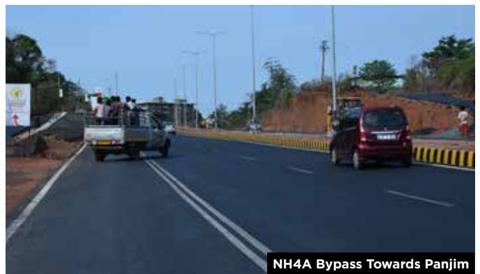
NH4A Bypass Towards Panjim