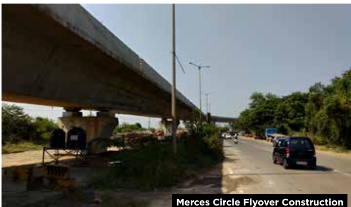
Merces Circle Flyover Construction