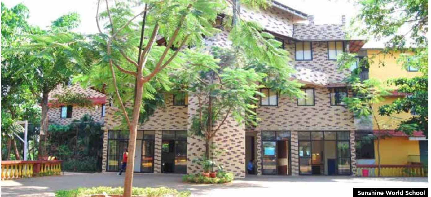
Sunshine World School

The Sunshine World School is minutes away from Expat VIDA. A popular school with a holistic approach to education, the Sunshine school has also earned itself the label of Goa Best Brand, 2018