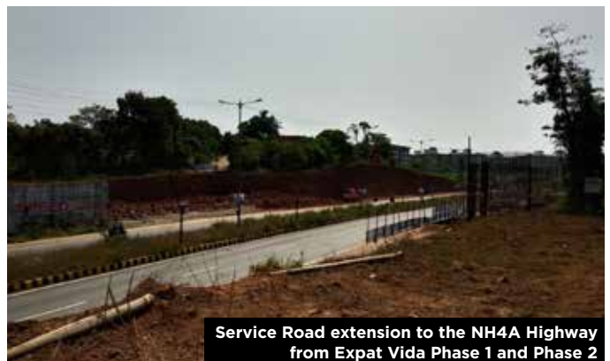
Service Road extension to the NH4A Highway from Expat Vida Phase 1 and Phase 2