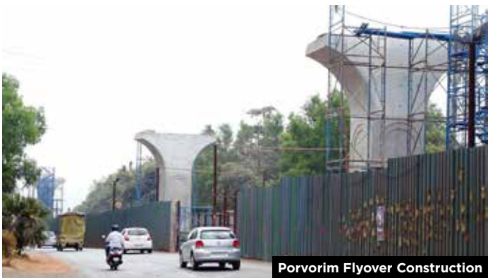
Porvorim Flyover Construction

The four lane bypass corridor that connects Panjim to Old Goa runs via Kadamba Plateau, and has a massive influence on the urbanization roadmap, even putting Kadamba Plateau in the list of smart cities to be considered.